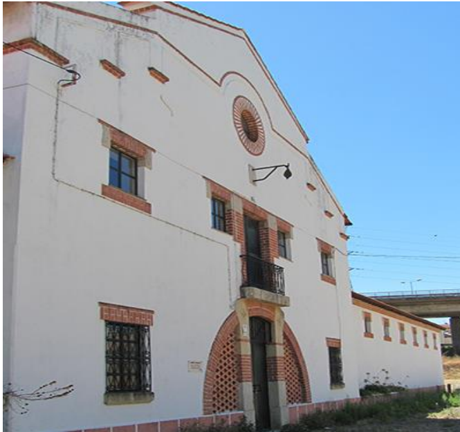
Museum of the School